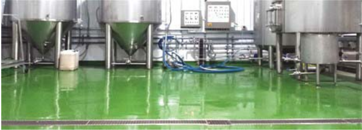
Brewery Floor - Installed by IFT