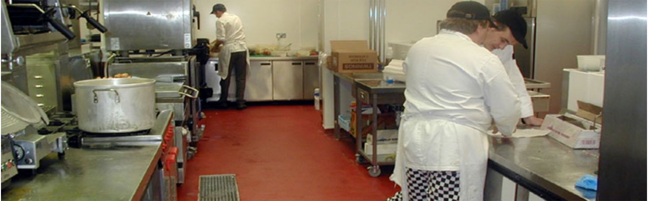
Commercial Kitchen Floor - Installed by IFT